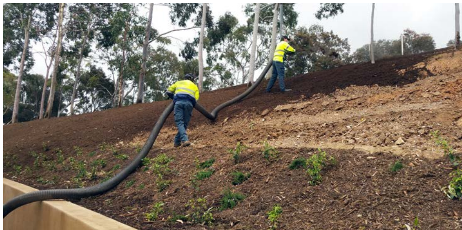
Jeffries PowerScaper can install up to 100 m3 per day with up to 60m of hose.