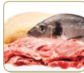
MEAT & SEAFOOD