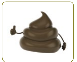
PET POO & BEDDING