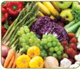
FRUIT & VEG

Food leftovers, garden trimmings and other organics can be placed in your GREEN BIN and will be processed into nutrient rich compost, soil & mulch.